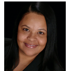
Dolly Hunt Pend Oreille County Prosecutor